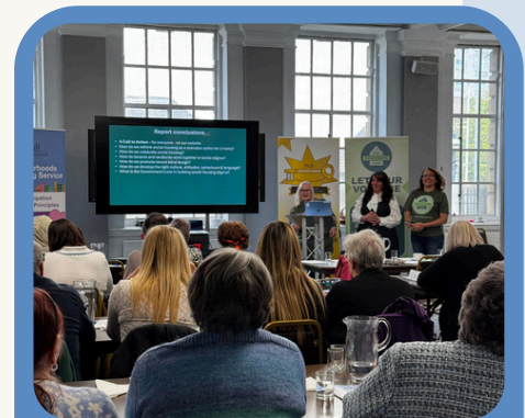
Tpas North East Regional Meeting

Hull City Council were delighted to host the Tpas North East Regional Meeting in May. More than 80 members from across the North East came together at The Guildhall to hear about the latest policy changes from the Regulator of Social Housing, the work being undertaken by the Stop Social Housing Stigma Campaign, and the fantastic work carried out by the Multi-Storey Living Group and Women’s Voice Tenants And Residents Association (TARA).