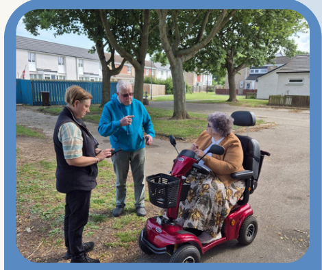
Local area walk around the Kingscott Close area

As part of the Let's Talk Housing Campaign, a volunteer was joined by members of the Tenant Participation Team at North Point Shopping Centre in Bransholme. They spoke to 25 people about the opportunities available and dealt with 5 housing enquiries. Scroll to the calendar at the end of this newsletter to find out where the team will be next month