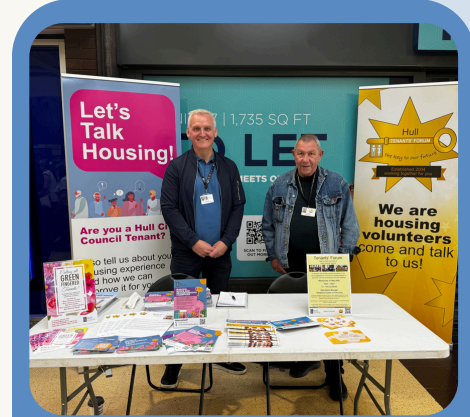
Let's Talk Housing Campaign at North Point Shopping Centre