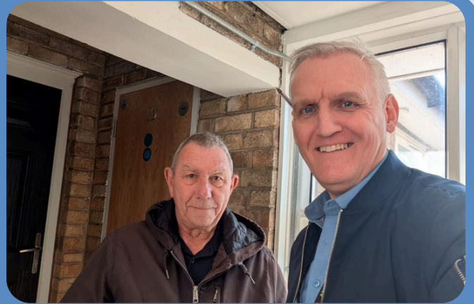
One of our champions out on a block inspection

Please note that dates and times are subject to change.