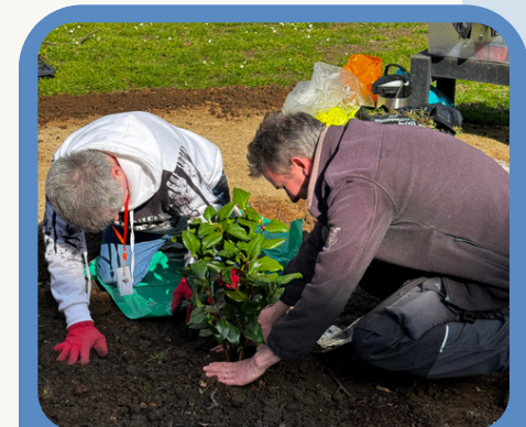
Australasia Houses Planting Day