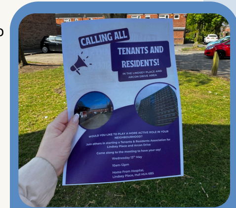
Leaflet drop around Lindsey Place and Arcon Drive area

YOU SAID: While the team attended the Autism Awareness Event, they spoke to a Senior Sensory Social Worker who offered feedback suggesting that a phone number be included on posters to give residents the option to text if they wish to attend meetings.