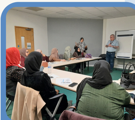
Women's Voice TARA Training session

One of our officers attended the West Hull Rugby Club coffee morning which was organised by Help for Heroes. A total of 55 people were present, raising issues including fly-tipping, leaf collection, gully issues, where to go to change Council Tax details, and how to apply for recycling centre vouchers.