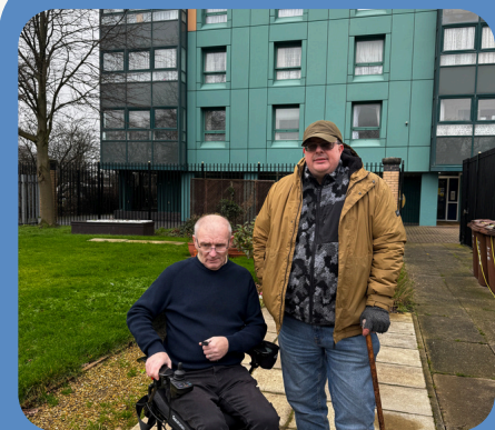
Filming at Bayswater Court

The Tenant Participation Team is always happy to help support TARAs in any way we can. One of our digital officers was asked by members of the Bayswater Court TARA if they could help support them by filming a three-minute video to help support their application for the Kew Gardens Grant.