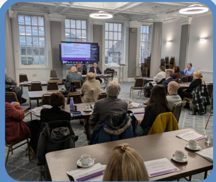
Housing Revenue Account Budget Consultation

The Customer Access Focus Group came together to review performance of the 300 300 Call Centre, the Customer Service Centres and Hubs across the city. The group were informed of future plans for Community Hubs and were asked to provide feedback on potential locations and opening times.