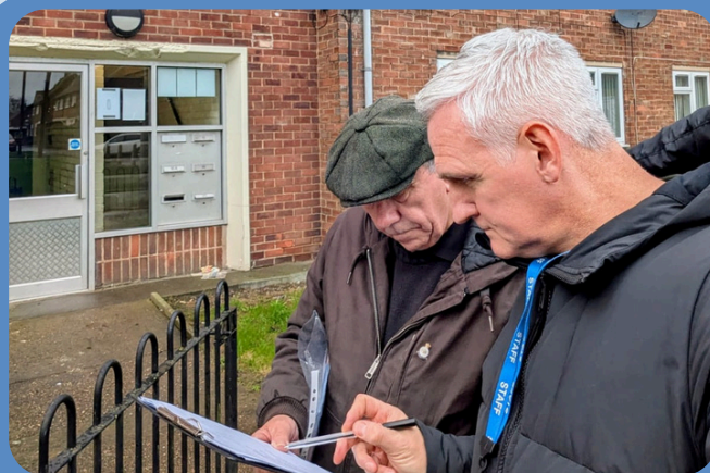
Tenant Participation Officer with one of our champions out on a block inspection

Please be aware dates and times are subject to change.