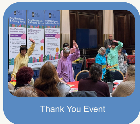
Thank You Event

On behalf of Neighbourhoods and Housing, we would like to thank everyone who has volunteered this year, whether attending meetings, talking to the Tenant Participation Team in the community, or sharing your views through a questionnaire, your support and views have made a real difference.