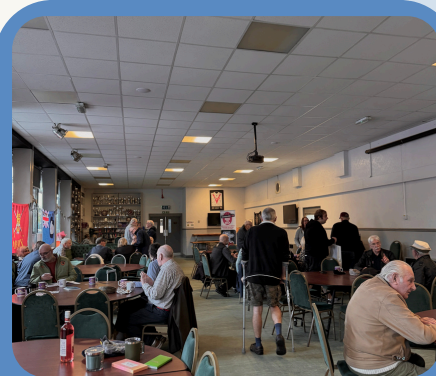
West Hull Rugby Breakfast Club

Officers from the Business Change Team engaged with the Multi Storey Living Group about a proposed new Multi Storey Living digital noticeboard scheme that is being investigated to be included in all high-rise flats to communicate important housing and building safety messages.