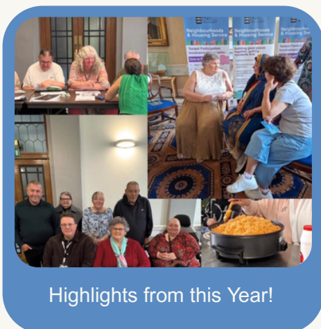
Highlights from this Year!

The Chair of the Forum spoke about the events and activities delivered throughout the past year and presented a short video showcasing the highlights. Followed by the Assistant Director Neighbourhoods and Housing, thanking all volunteers for their support and sharing plans for the year ahead.