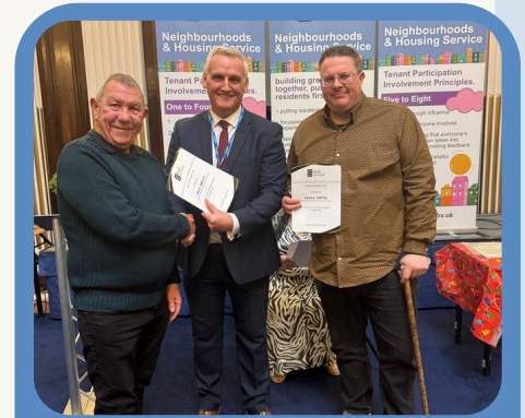
Congratulations to our Block Champions

To celebrate the incredible work of our gardeners, 27 awards were presented to the winners of this year's Garden Competition, recognising their hard work, creativity, and dedication. The judges were delighted by the amazing communal gardens, eco gardens, containers, and more, showcasing the talent and care of the community. Each winner was proudly presented with an award by the Tpas National Consultancy Manager.