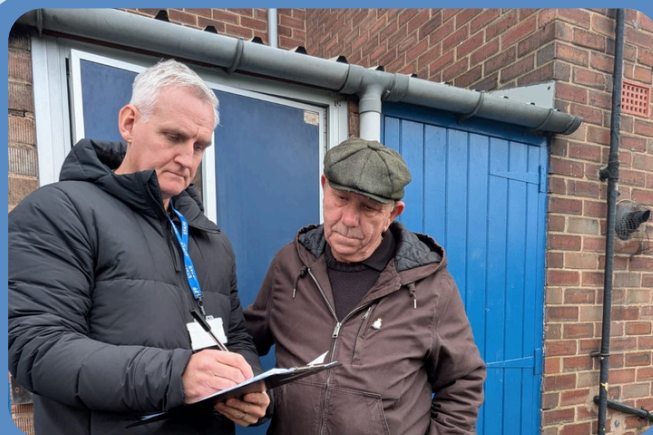
Flat Inspections on Triton Road and in the Bilton Grange area.

Please be aware dates and times are subject to change.